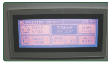
PLC control touch screen panel