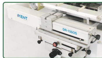
2 color pneumatic shuttle