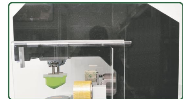
Stable granite stone machine structure