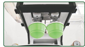
2 independent pad cylinders