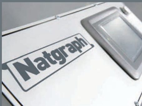
Touch Screen PLC Control