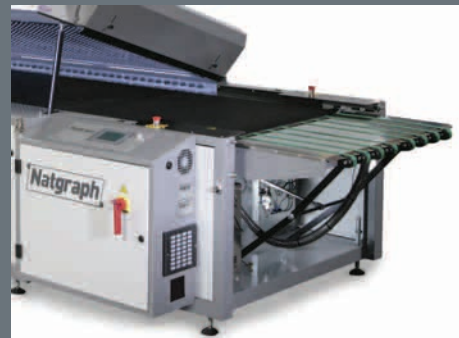
Optional drop down inlet