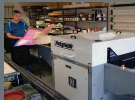
Compact UV Dryer - Proofing