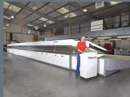
Natgraph's longest dryer - 23m