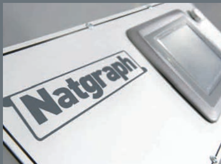
Touch Screen PLC Control

Variable Output of Infra Red Lamps: An optional system can be fitted to control the output (power level), of the Infra Red lamps on a percentage basis, this system can be very useful when the effects of the IR can be critical, or are unknown. This system is controlled by the Touch Screen PLC Control System with a digital output.