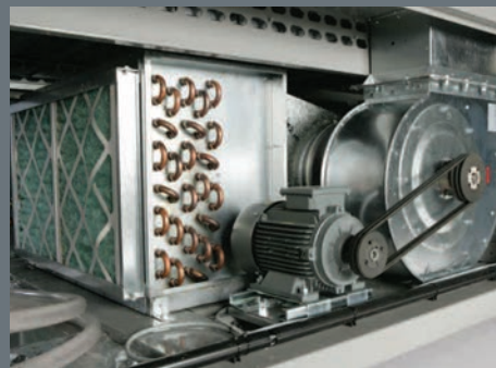
Refrigerated cooler module