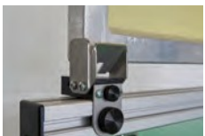
Lower screen holder