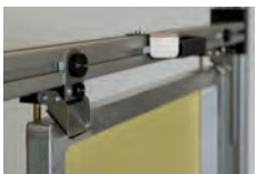
Upper screen holder